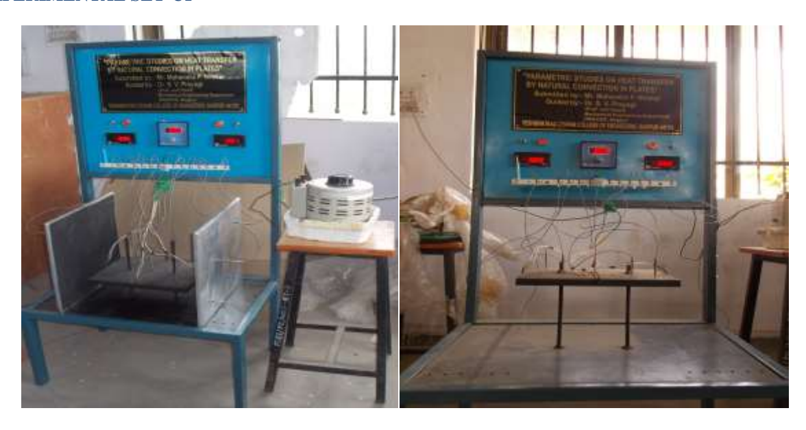
Fig1- Experimental set-up with and without vertical confining walls.

The experimental set-up consists of following instrumentation –